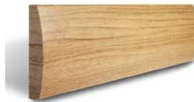
Crescent Valance available on 2 & 2.5" Signature Faux Wood 2" Signature Composite Woodgrain