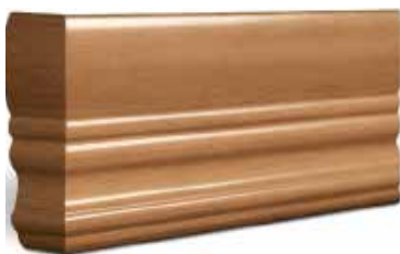
Crown Valance 2 & 2.5" Signature Faux Wood

The Deluxe Cordless is available up to 84" x 84". Blinds over 84" x 84" must use the Lift N Lock system. See page 2